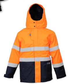
Oversized and adjustable Hood to suit Hard Hat usage