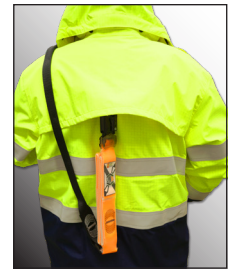
Back Harness Delta Entry Point for at-height use